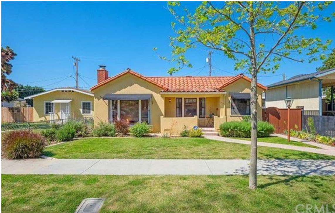
Front façade, view facing west Taken July 18, 2017